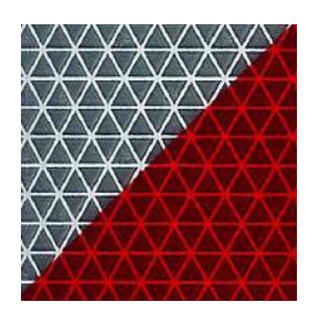
Figure 1 - Specific pattern and application directions

ORALITE<sup>®</sup> 5951M sheeting is available as rolls in white (010) & red (030) alternating stripes. The sheeting conforms to the daytime colour requirements in tables 2 when measured in accordance with the corresponding specifications, the provisions of CIE No. 15.2, and shall comply with the specifications of DIN 6171: 2013-10.