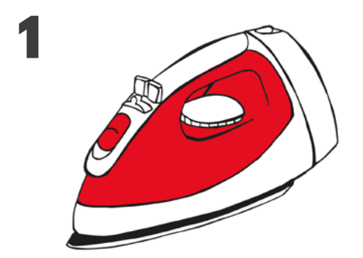
Preheat the iron to 150° C – 175 °C. (Cotton mode, no steam)

FIRST, WASH THE FARBIC WITHOUT CONDITIONER AND IRON IT.